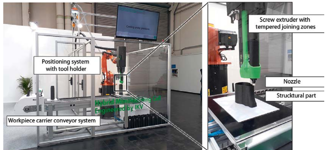
Fig. 1. IKV's hybrid production cell in live operation at the Hanover Fair 2018, as it produces a structural part at a production speed of 6 g/min

over, functional integration increases machine productivity by eliminating downstream processing steps, such as the joining or mounting of components. In an overall concept with greatly reduced tooling invest, rapid manufacturing will enable economical production of such structures for small series.