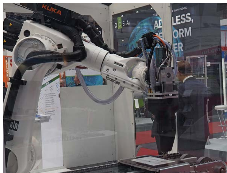
Fig. 3. Pilot plant with exchangeable construction bed module for application-oriented use as presented at the Fakuma

The screw-based additive production system is being industrialized in cooperation with the equipment manufacturer Yizumi Germany GmbH, Aachen, Germany. Aiming at an industry-ready solution, the IKV and Yizumi Group will work very